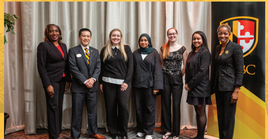
Scholarship Recipients with Board Members at the 2024 Alumni Awards

THE ALUMNI BOARD REACHED THEIR FUNDRAISING GOAL OF RAISING THE VALUE OF THE ENDOWMENT TO $500K