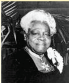
Dr. Mary McLeod Bethune (1875-1955)

Founder, Bethune-Cookman College, Founder, the National Council of Negro Women