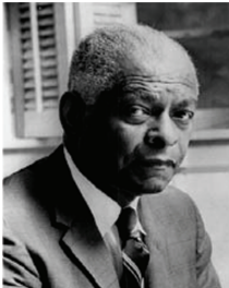
Dr. Benjamin E. Mays

Founder, Bethune-Cookman College, Founder, the National Council of Negro Women